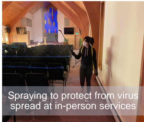
Spraying to protect from virus spread at in-person services