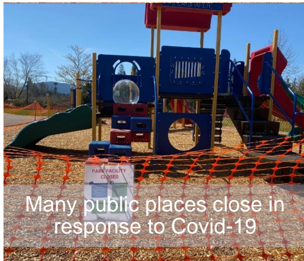
Many public places close in response to Covid-19